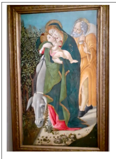
The Flight into Egypt, Botticelli